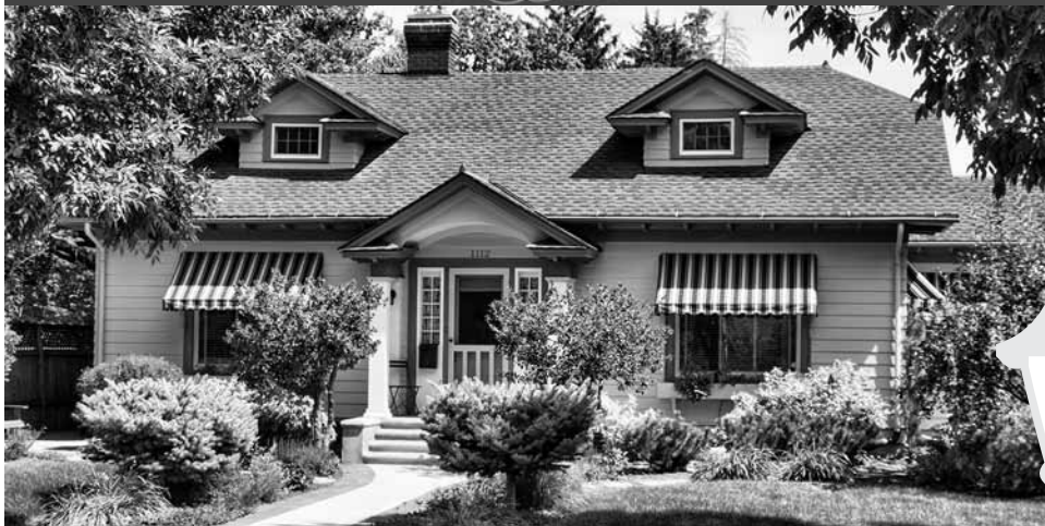
The Harry & Mabel Bigham House