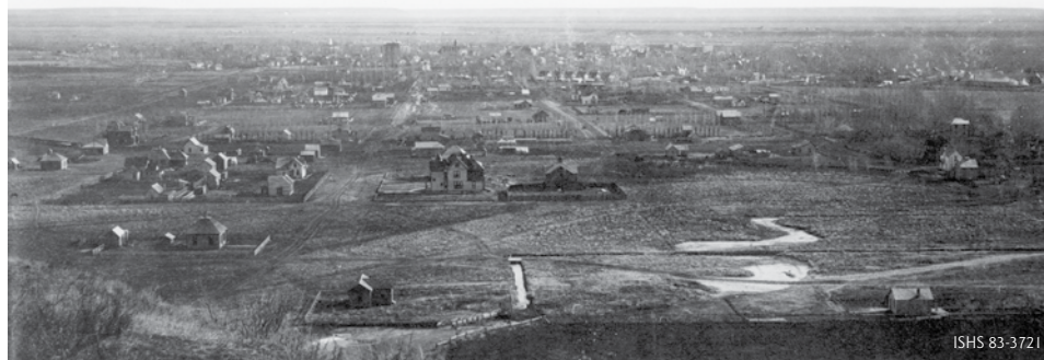
Below: View from the foothills of the North End in approximately 1900. Note the intermittent development, ill-defined roads, and rural feeling of the neighborhood.

Derek Hurd North End Neighborhood Association Historic Preservation Chair