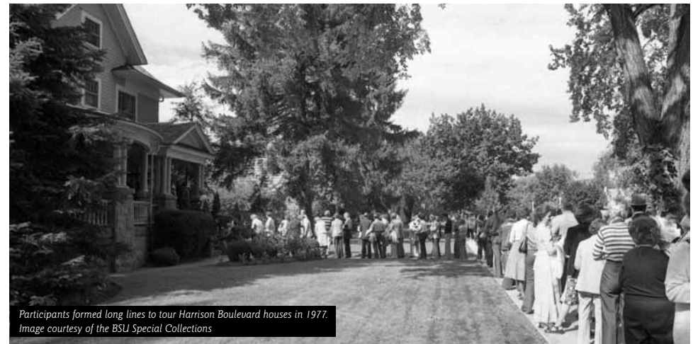
Participants formed long lines to tour Harrison Boulevard houses in 1977.

To ensure a neighborhood of aesthetic quality, lots in Highland Park came with deed restrictions requiring homes to be of at least $2,500 to $5,000 in value depending on location. Lots fronting Harrison Boulevard and 18th Street were deeper and 18th Street was wider to accommodate the streetcar line, an amenity of suburban living. It was, in effect, Boise's first planned community, and it was successful, as the lots sold quickly. Although the lowest $2,500 limit was high for its time, it did not entirely exclude middle-class families, and the homes along Harrison Boulevard include bungalows and cottages of more modest means among the larger American Foursquares, Craftsmans, and an assortment of period revivals that fill its lots.