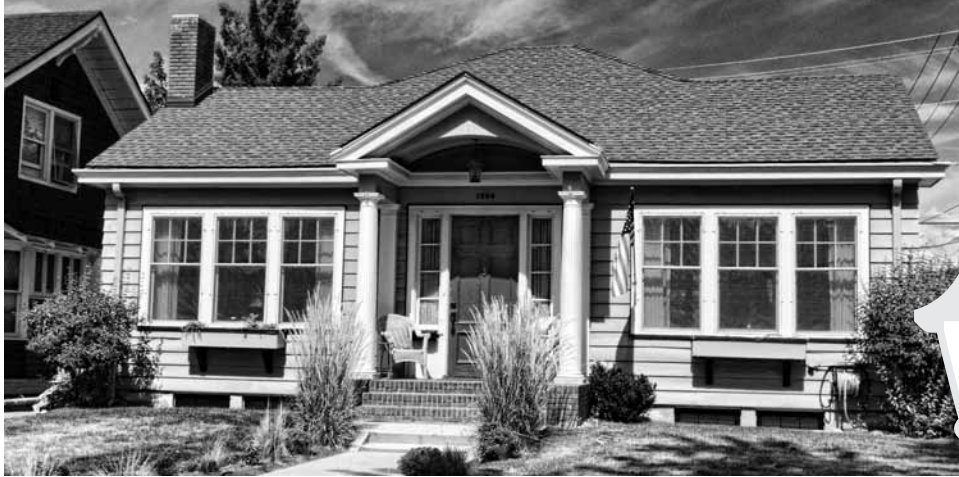
The William & Etta Dunbar House